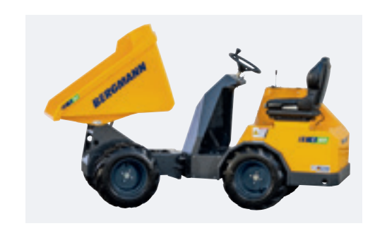
C801e – the little brother with a width of 980 mm and a payload of 950 kg

Good climbing capacity meets simple operation: The Bergmann e-dumper C802 has rightfully earned its classic status. It easily overcomes high gradient angles – always running quietly and with low operating costs. With its emission-free e-drive and compact dimensions, being slimmer and lower than many comparison models, the C802 is optimally suited to interior demolition applications or narrow, inner-city building sites as well as landscaping