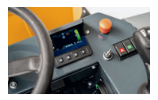
Modern user interface