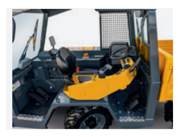
Rotating driver's platform for additional safety