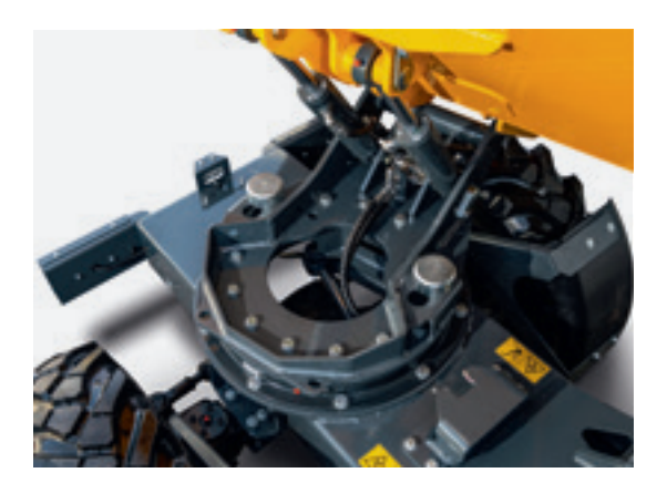
Durable technology – made in Germany