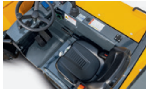
Clearly laid out and comfortable: the driver's platform